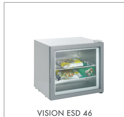
VISION ESD 46