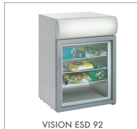
VISION ESD 92