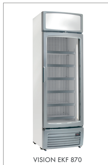
VISION EKF 870