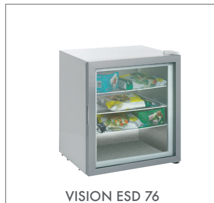
VISION ESD 76