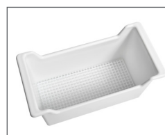
FOOD BUCKET (FDA-APPROVED FOR FOOD)