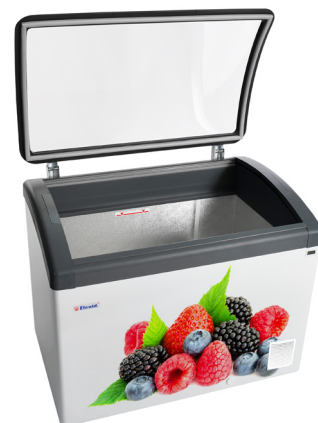
FOCUS 106 V WITH OPEN LID

The FOCUS V freezer has an elegant, yet robust, design to optimally catch the attention of your customers. The lid design, the improved insulation and the heated frame ensure minimum ice build-up.