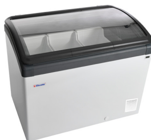
FOCUS 106 V WITH BULK CONTAINER