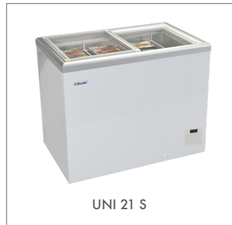
UNI 21 S