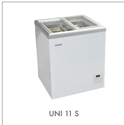
UNI 11 S