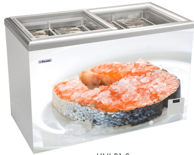
UNI 31 S