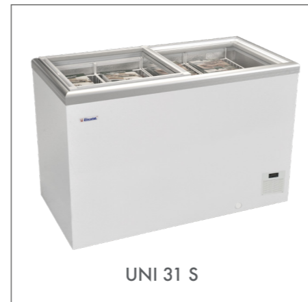
UNI 31 S